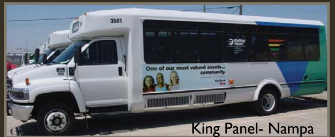
King Panel- Nampa