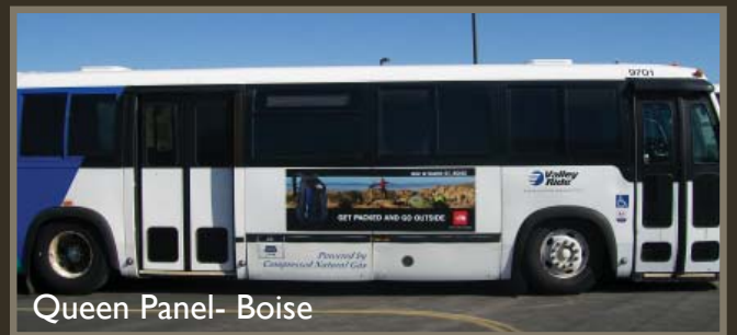
Queen Panel- Boise