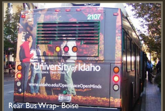
Rear Bus Wrap- Boise