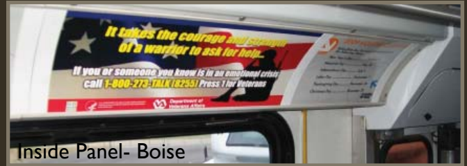
Inside Panel- Boise