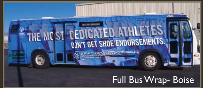
Full Bus Wrap- Boise

Arbitron Report: Outdoor Advertising and the Media Plan