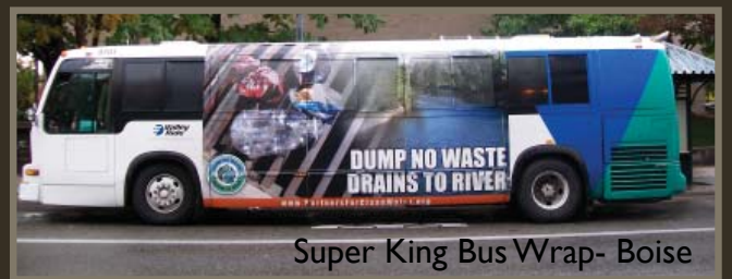
Super King Bus Wrap- Boise